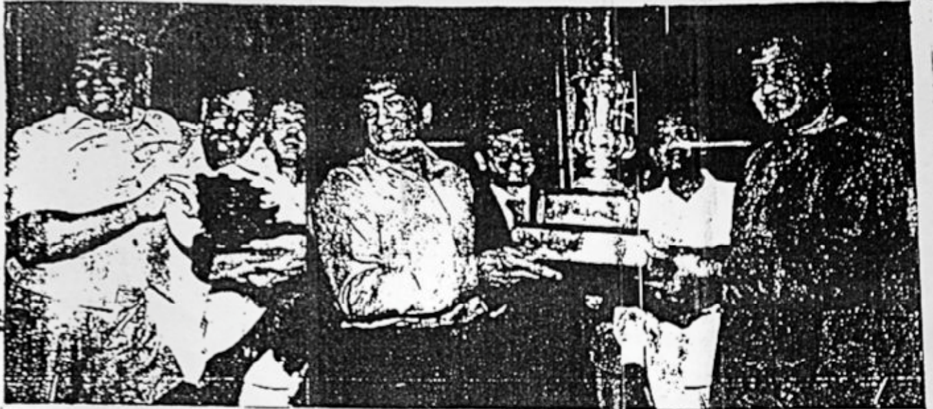
అగర్వాల్ ట్రాస్ట్ వారికి అందజేసిన అవార్డు